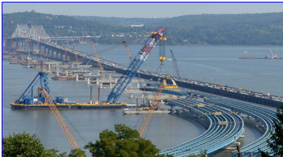
Tappan Zee Bridge